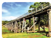
TRESTLE BRIDGE ON CAMPERDOWN/TIMBOON RAIL TRAIL